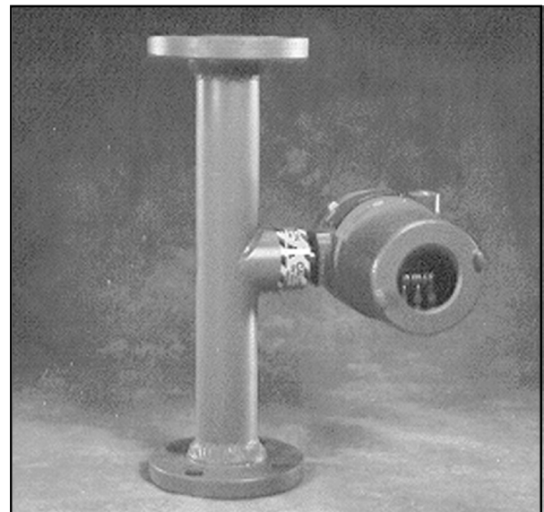
WCM 7300 Water Cut Monitor

Monitoring and early detection of undesirable conditions as well as interface detection during de-watering of storage tanks.