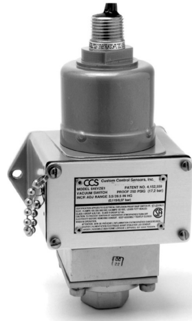
SHIPPING WT. APPROX. 56 OZ. (1587 GRAMS)

Press. .4 to 5000 psi Vac. 1.0 to 28.5" Hg