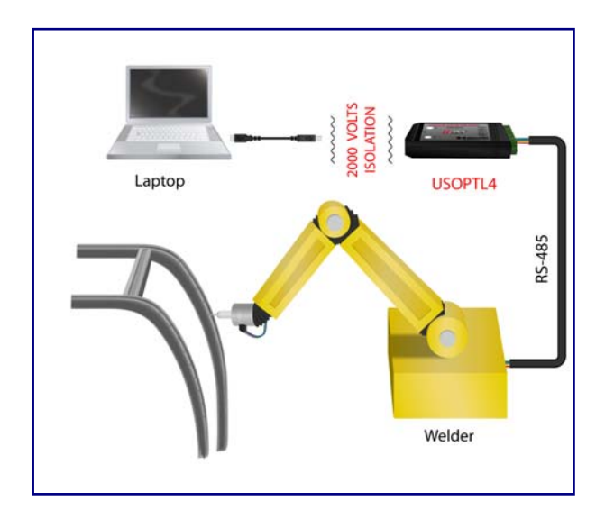
Connects PCs or laptops with USB ports to devices with RS-232, RS-422, or RS-485 ports.

Models USOPTL4 and USPTL4 are USB to one port RS-422/485 converters. Supporting 2-wire RS-485 or a 4-wire RS-422/485 communications, these devices are great for any application that requires long range or multi-drop capabilities. Both models use pluggable terminal blocks on the RS-422/485 side and have a pair of LEDs that indicate data being transmitted or received. Model USOPTL4 includes special circuitry that adds 2000 volts isolation protection against ground loops and voltage spikes. Both products draw power from the USB port so no power supply is required.