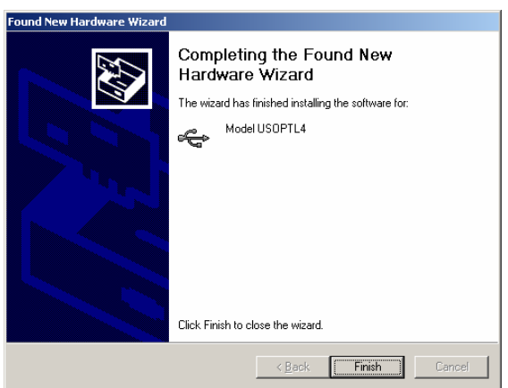
#3. The screen above will appear. Click the Finish button to complete the installation.

#2. The screen above appears. Make sure Install the software automatically is selected. Then select the Next> button.